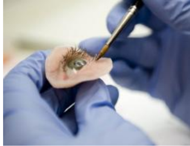
Final coloring of your prosthesis