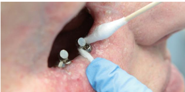
Cleaning with stretched out cotton-tipped applicator