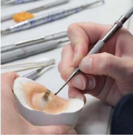
Sculpting your prosthesis in wax to create a mold