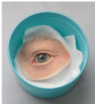
Storing your prosthesis