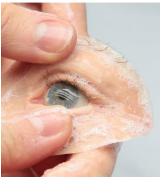
Gently clean your Prosthesis with your fingers