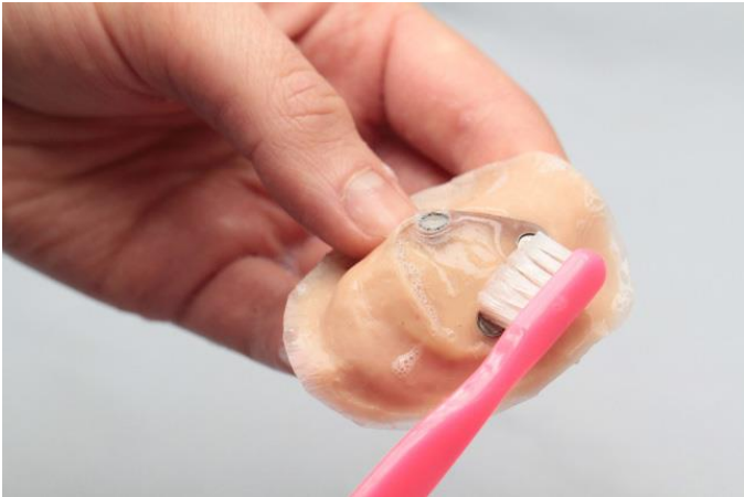
Clean the magnets of your prosthesis

It is best to remove the prosthesis before going to sleep. This will give your tissues time to breathe and help you to establish a daily cleaning routine for your prosthesis. You will be instructed on the best method to remove your prosthesis by the clinician at your delivery appointment. Do not pull on the thin margins as they will tear. It is best to hold the prosthesis by the thickest part and rotate it off the bar or abutments to release the clips or magnets. Pulling on the thin areas of the prosthesis may cause the silicone to separate from the hard plastic section. Try to find the easiest path to removal.