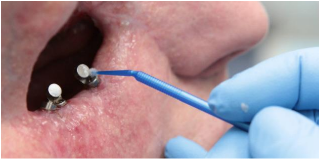
Cleaning with micro brush

Maintaining good hygiene around the abutments, bars, magnets or other attachment systems is very important to the long-term success of your prosthesis. Follow the daily routine provided for you every day. Use a mild soap and the soft toothbrush provided or saline moistened cotton-tipped applicator to clean around the abutments. It may be easiest to do this in the shower. You will be given micro brushes to help clean around the abutments. Use these brushes to clean areas that a toothbrush or cotton-tipped applicator will not fit. You can also use a cotton-tipped applicator with the cotton stretched out like a rope to access hard to reach areas.